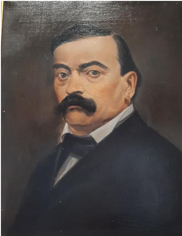
Patriot from Todi