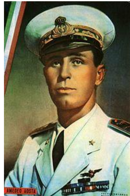
Member of the former Italian royal Family